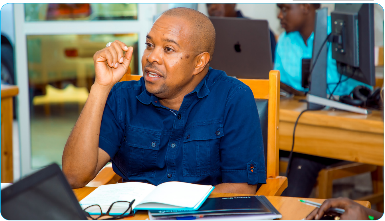
Deputy Minister of State in the President's Office, Public Service Management, and Good Governance, Ridhiwani Kikwete, speaks at NeST taskforce camp in Iringa

Tenderers registered with the new e-procurement system named NeST, up to November 21, 2023. The system is accessed through nest.go.tz